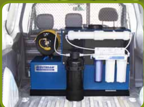
Picture showing a 250Ltr system with Reverse Osmosis Filter Option

The ECOSTREAM™ range of tank systems represent excellent value for money as they are modular in design and can be fixed into vehicles permanently without the need of a stainless steel frame to do so. This allows significant savings to be made over against traditional systems, without compromising on the professional image that window cleaners always strive for.